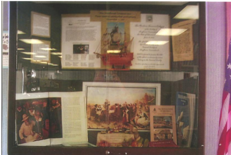
Above photo: a portion the Cortland Branch display; this display will be moved to the main W-TC Library on Dec. 1 st .