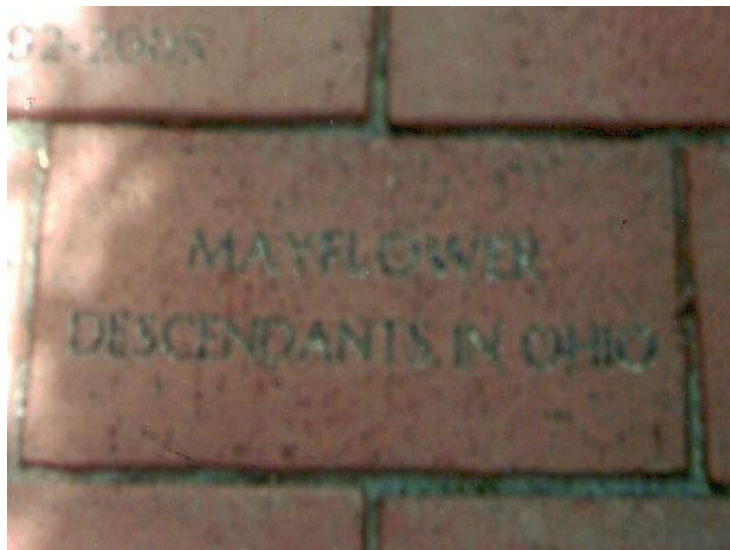
Brick donated by Society of Mayflower Descendants in Ohio