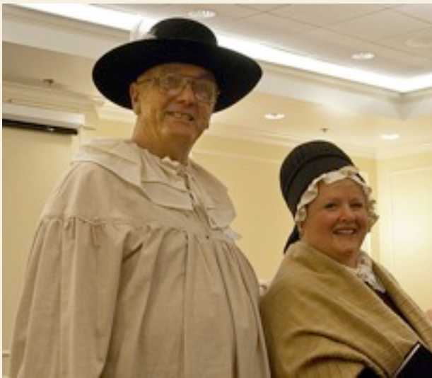
Attendees enjoyed meeting and getting to know SMDOH members from other colonies.