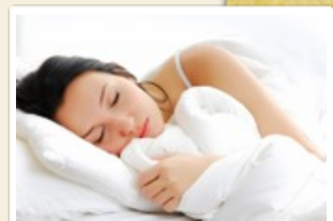
Sleep is one of our major biological cycles.

“Insomnia is often associated with other medical concerns.”