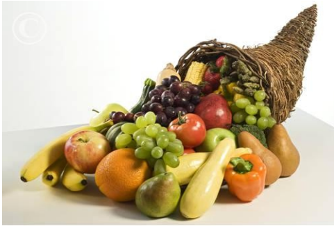
u13673552 [RF]